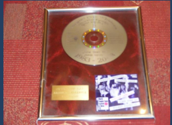
Plaque for the 25th jubilee (International Yamaha Festival, Tokyo - Grand Prix; Golden Disc Award) of 'Times Goes By' song, written for the Neoton Família in 1983