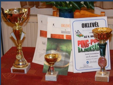
Tennis and table tennis trophies